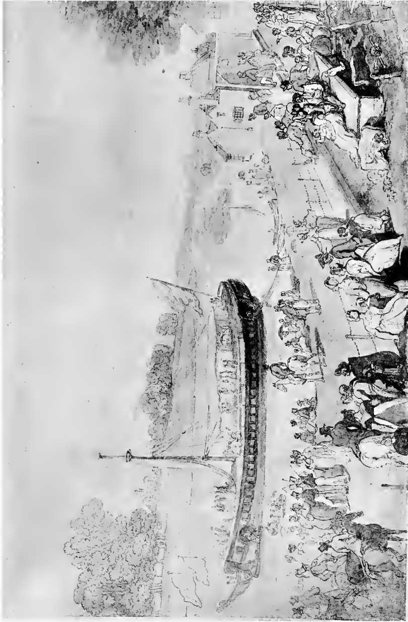
ROWLANDSON (THOMAS) Original Water Color Drawing (No. 913)